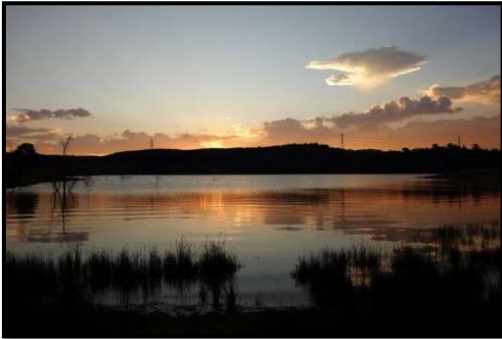
Thommos on sunset