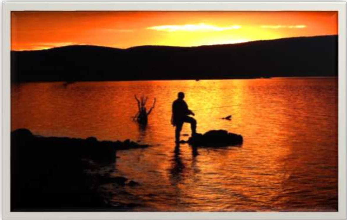
Sunset on the water