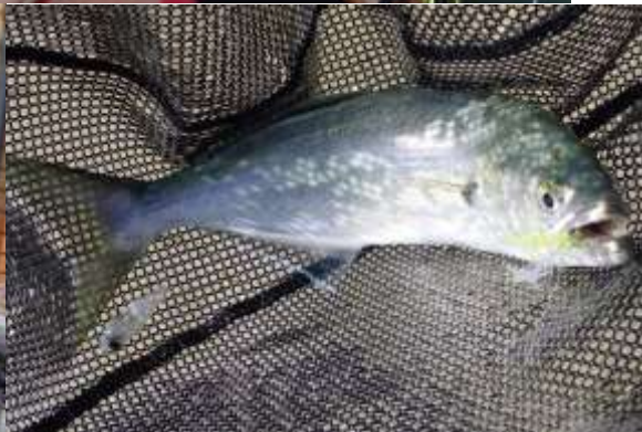
A Fiona caught tailor on a Clouser from the tying day