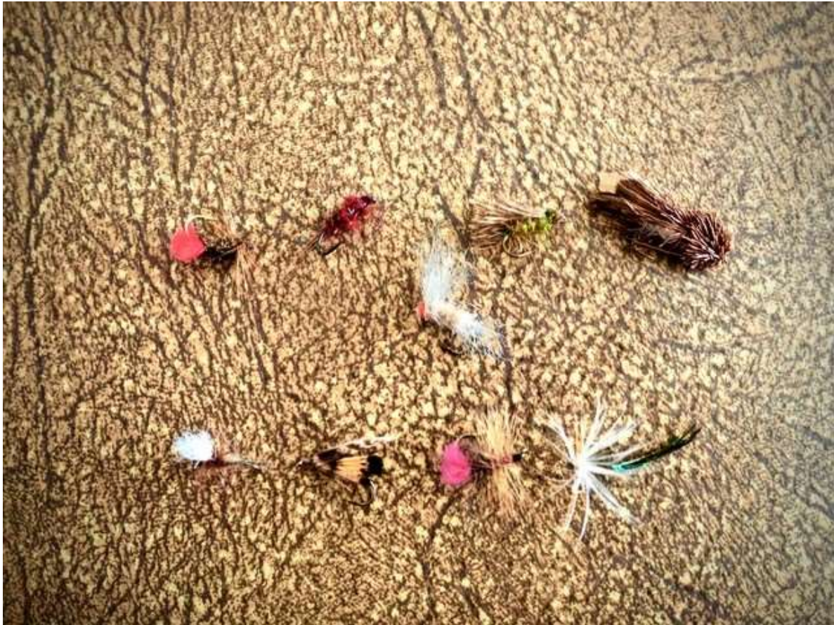
Rod's Fly Swap