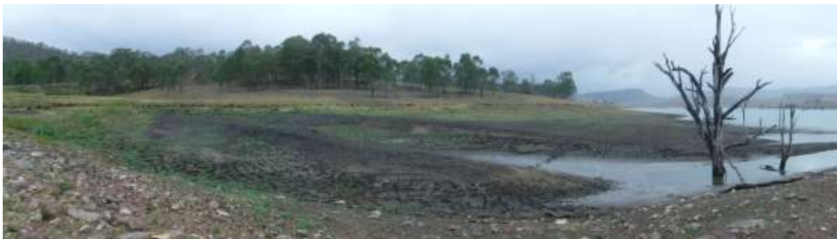
An idea of just how low the water is at St Clair.