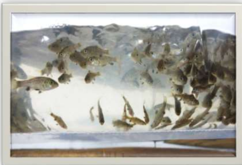
Bass ready to be rehoused into Lake St Clair