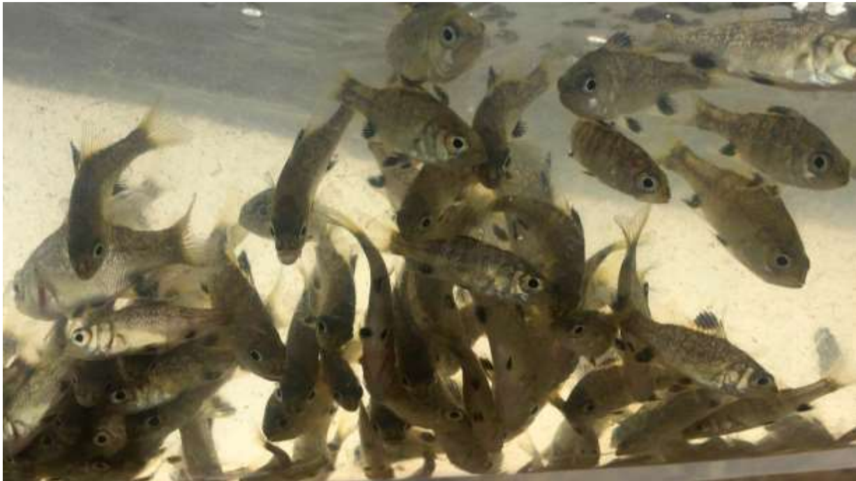
Juvenile bass ready for release