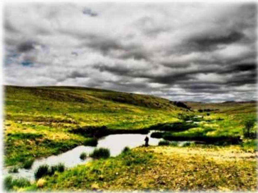
Rod Dillon Fishing the plains