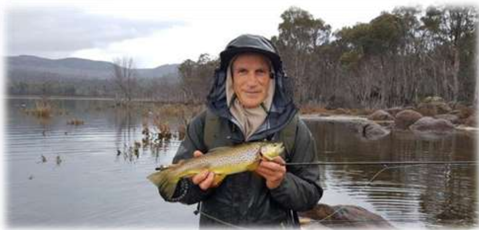
My first fish of trip at Arthurs

Arriving at the once shanty town of Flintstone, on Arthurs Lake (now more upmarket due to permanent land tenancy and enforced building codes), we unpacked and slipped into more comfortable fishing outfits. Fishing gear loaded, we jumped into the truck and headed for the Cow Paddock on Arthurs to stretch our legs and rod arms.