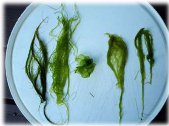
It's a gateway drug

I told myself it would be a one off, rigging up a floppy fiberglass rod from childhood with a float and a sz 10 caddis hook, I wandered down to the foreshore to while away the afternoon. The thing is, I didn't realise how hard it is to score weed if you don't have someone to hook you up. The first few attempts were miserable failures, until I stumbled across a patch of high quality "green". From there it was a matter of learning a whole new fishing craft, carefully balancing the float, watching for the slightest aberration in drift, before setting the hook (sometimes) into a stripy vegetarian brawler. The addiction grew and suddenly I was outlaying cash on a dedicated luderick outfit and struggling with the intricacies of a centrepin reel. Still, it was just until the rivers opened again, I told myself I could quit any time.