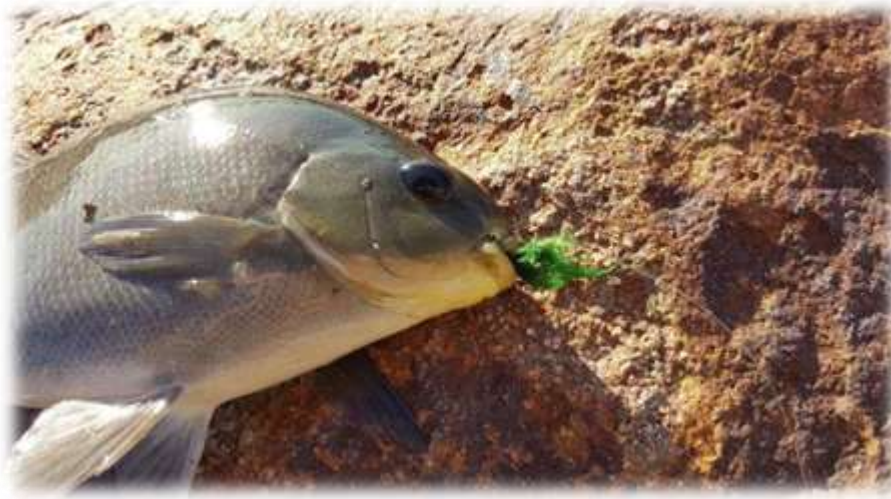
A woolly bully

The day after the delivery arrived I rushed from work to the foreshore, cursing the super-car induced congestion. Hurrying from the car I passed two other luderick fisherman carrying the tools of the trade. “Any luck?” “Nah, they’re quiet, been here a few hours and only got a couple of downs, no fish. You chasing them on fly eh? Good luck!”. Oh well, the plan was to get a couple on bait before switching to fly if they were on the chew anyway, so at least I was still in with a shot. That plan came quickly unraveled upon reaching the water and realizing the nut on the back of the centrepin had worked its way off. Tony Alvey may have had some great ideas, but foregoing a locking nut was not one of them.