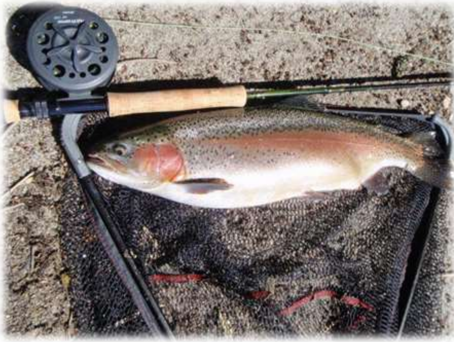
A well-conditioned 4.5lb Lake Otamangakau rainbow with snow- capped Mt Ruapehu in the background from Wayne's recent NZ trip