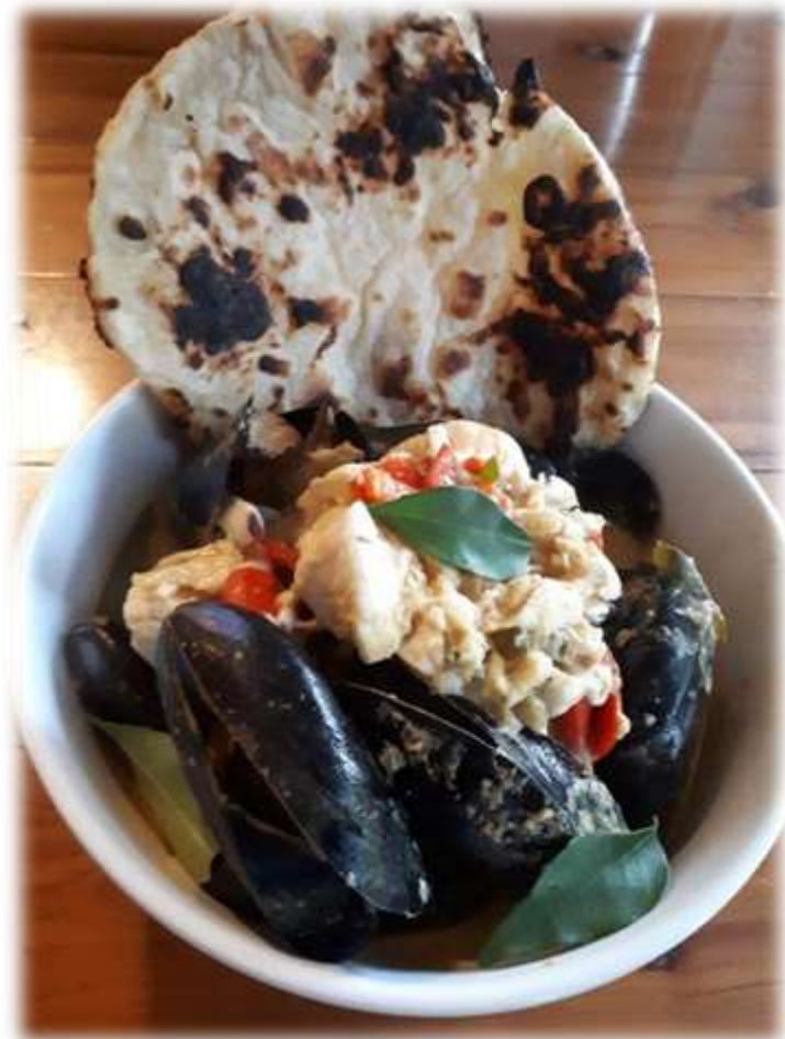
A Malaysian curry with all the forbidden seafoods and a homemade sourdough roti