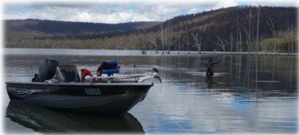
Peter casting to dun rises on Woods Lake

Building on our experience from the previous day we hoped to be in the zone when we arrived at Woods the next morning, but not the case. The fish were turned off all day with only 1 caught. A Jan Spencer possum emerger had a fish to the boat and another dropped. It floated all day with floatant applied to wing only. This now meant that we were on the lookout for a roadkill possum to tie up a batch.