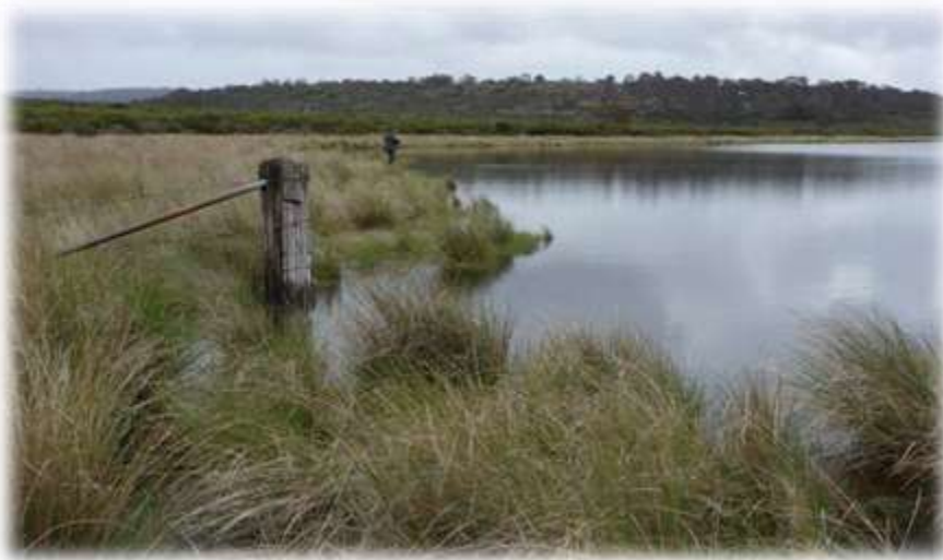
Lone figure on Little Pine

Willy weather advises that we will have showers the next day, so we hatched a plan to fish the Cricket Pitch area on Little Pine. The day was dismal, with a light wind and cold showers dogging our every movement. Even the fish decided to huddle down and after a 6 hour session and just a couple of fish and aching legs and back we decided to call it a day. This was to be our one and only trip to this challenging but pretty lake.