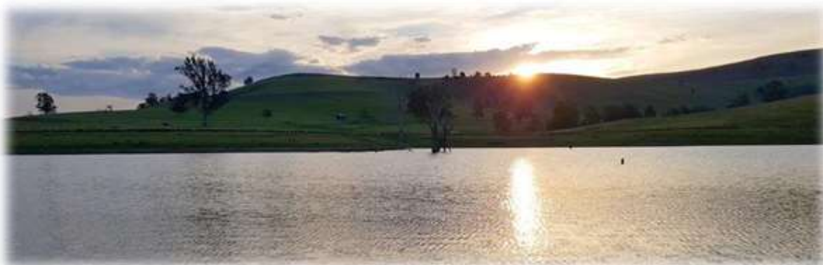
The sun setting on another top bass fishing trip at St Clair