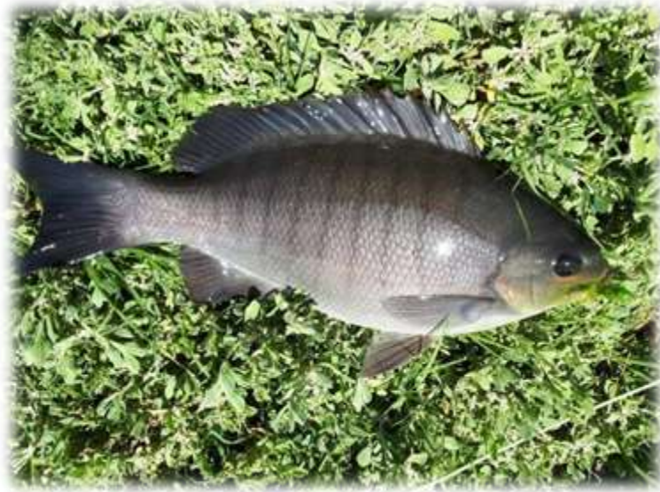
The kids are hooked on synthetic

At the end of the first drift with this new strain of synthetic the fly took off so fast I got line burn when I tried to strike. Clearly this fish had not read the textbook, and had a couple of attempts to head out to Stockton before succumbing and coming quietly to the net. It was a little tackier, just on 27, but it definitely wanted that fly. Even the kids are getting into synthetic.