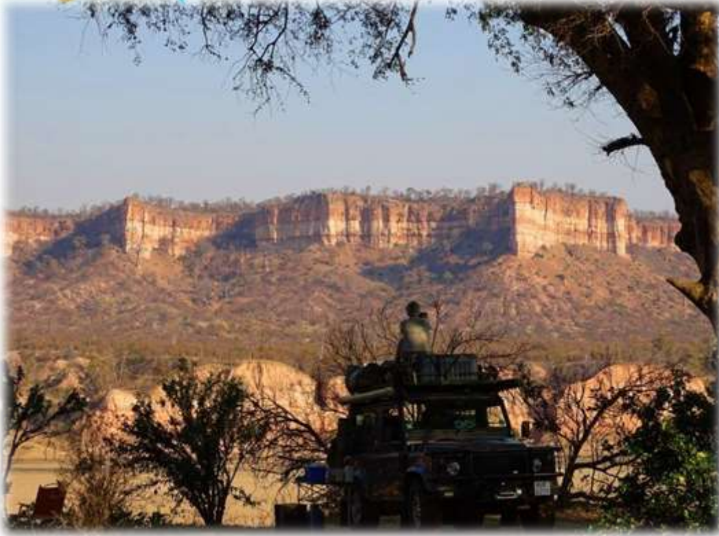
Tangus on safari in Africa