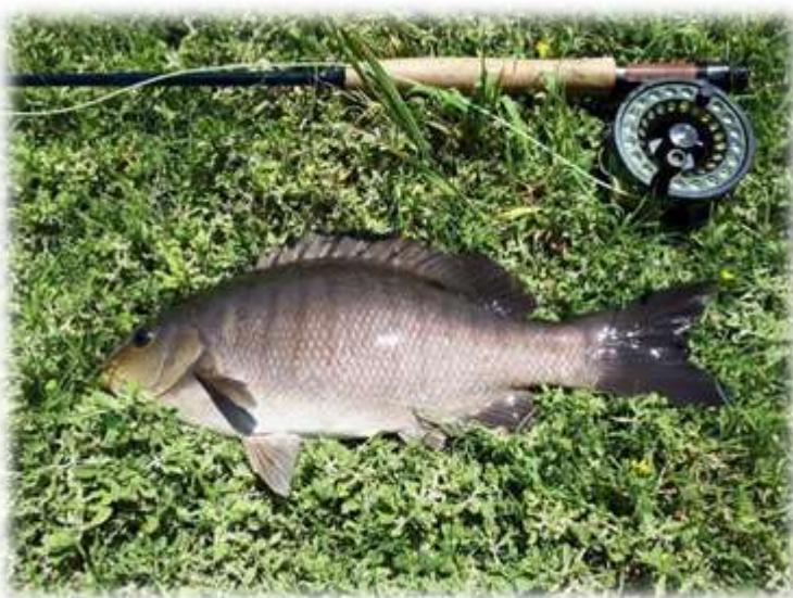
A broken reel a blessing in disguise

So this was it, no safety net as I sent the fly drifting down the berley trail, the indicator weighted to a hair trigger. The first few drifts came up empty, then my indicator dipped just under the surface, I struck hard and came up empty handed. Two more phantom strikes and I was thinking maybe my indicator was just getting waterlogged. The fourth time the fluff slipped gently under I gave it half a second more before firmly strip striking. This time the line came tight and the battle commenced. I’ve always felt there’s some similarity between the fight of a luderick and a brown trout, no big runs, but lunging and thrashing with dogged determination, and this fish was textbook. Eventually I guided the fish into the net, fly well and truly lodged in its gullet.