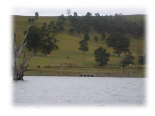
Exposed culvert from the original road.