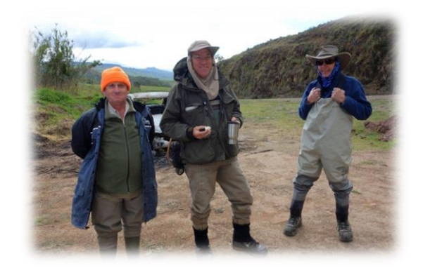
All rugged up on a cold and windy St Clair day