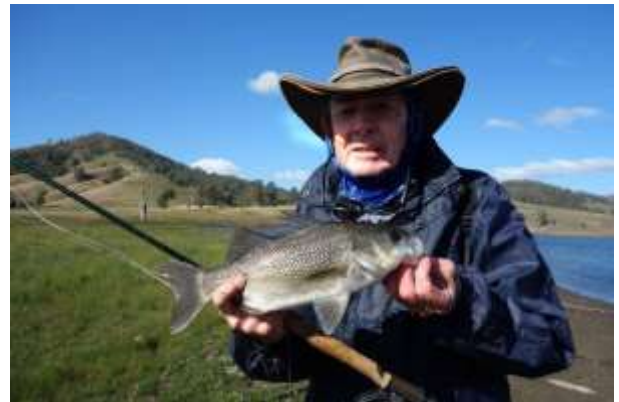
Les rugged up and still looking cold