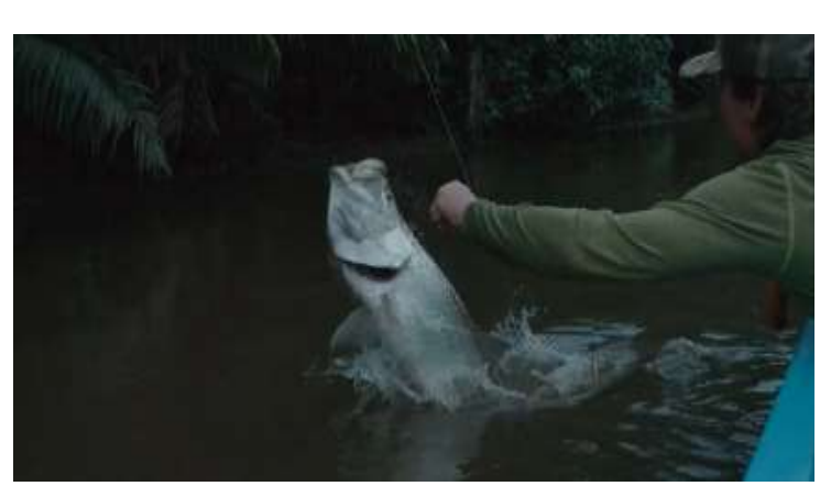
Please note that some of this material (pictures and words) was sourced from Gin-Clear Media's website from the Press Kit for the RISE Film Festival.

Atlanticus (several years in production) was about the mighty Tarpon, kicking off on the beaches of Gabon (South Africa) through to Mexico, followed up by going deep into Central America. In Mexico the crew fished a plague of locusts, these hoppers were enormous (you would need shares in a foam factory to make a hopper big enough to match-the-hatch).