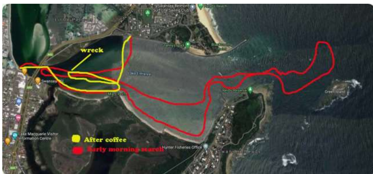
Swansea Channel showing our track