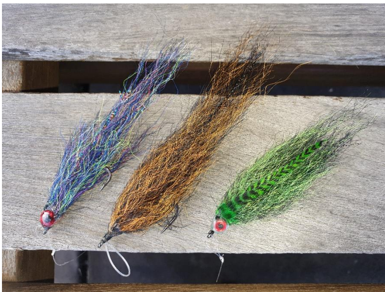
A few of my most successful cod flies tied for the Severn River. Wishin' I was-a fishin'

The next club meeting is on Wednesday 7th April at Bero Bowlo: see you all there for a 7.00pm start or earlier for a meal.