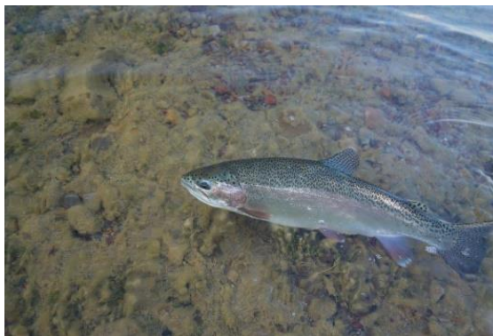
A tiger and rainbow from Friday's fishing